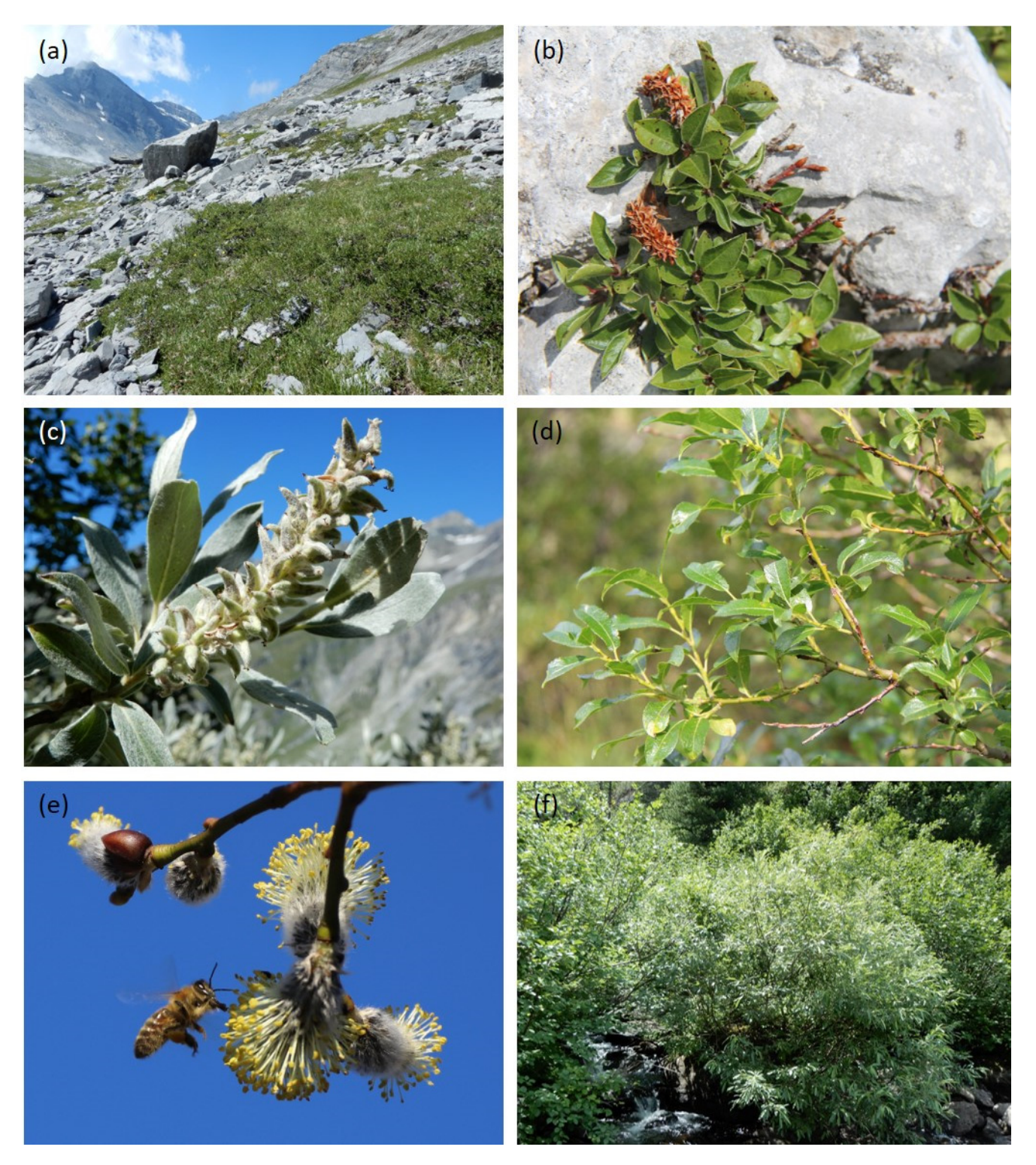
Figure 1. Selected Salix species that occur in the Alps. ( a ) S. breviserrata creeping dwarf shrub, ( b ) S. alpina with female catkins, ( c ) S. glaucosericea with female catkin, ( d ) S. mielichhoferi leaves, ( e ) S. aurita male catkins, ( f ) S. laggeri shrub.

Willows have adapted to a suite of different habitats across almost the entire elevational gradient from valley bottoms up to high alpine and subnival sites [11,25,26]. Willow stands often dominate the vegetation, and many species are characteristic for subalpine and alpine shrub communities, e.g., the associations Salicetum caesio-foetidae Br.-Bl. (1964), S. waldsteinianae Beger (1922), Salicetum helveticae Br.-Bl. et al. (1954), and alpine snowbeds,